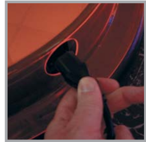
Unlock the Back of the Lollipop